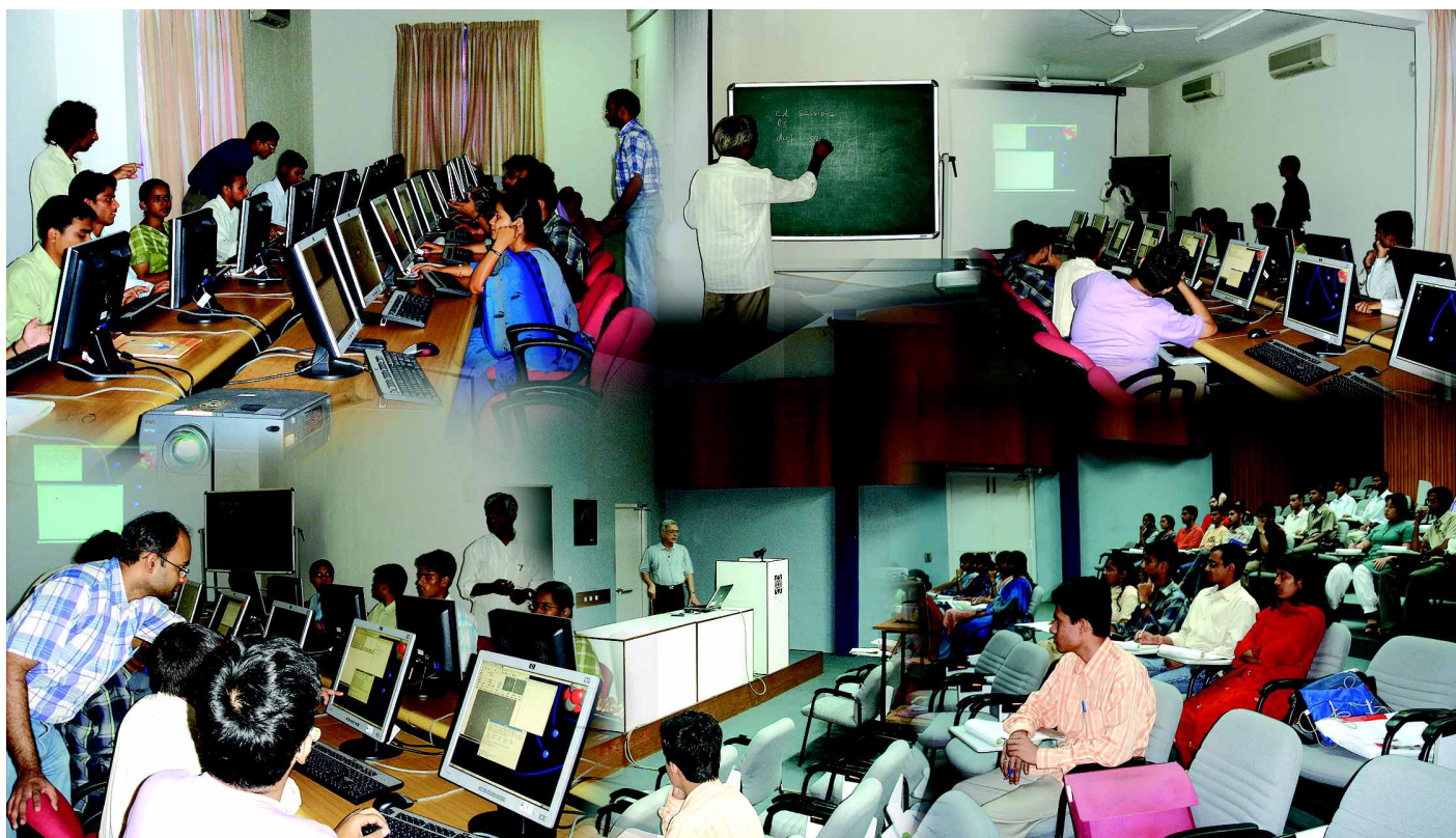
Lectures and practical sessions of the Introductory Summer School on Astronomy and Astrophysics

The Summer School funded by the Department of Science and Technology (DST) of the Government of India was conducted at IUCAA for a month beginning May 15, 2006. Twenty-eight students studying physics at the final year B.Sc. or first year of M.Sc. as well as students of engineering in their third year participated in the school. The programme consisted of a series of lecture courses, evening lectures on special topics, image processing and data analysis sessions and problem solving sessions.