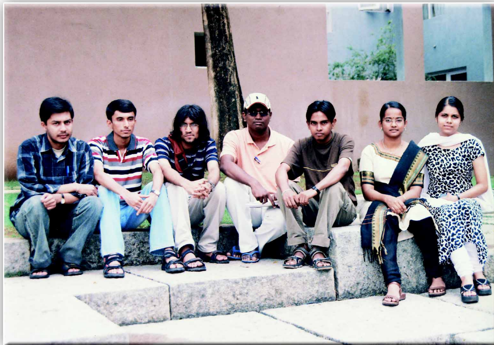
Participants of the Vacation Students' Programme