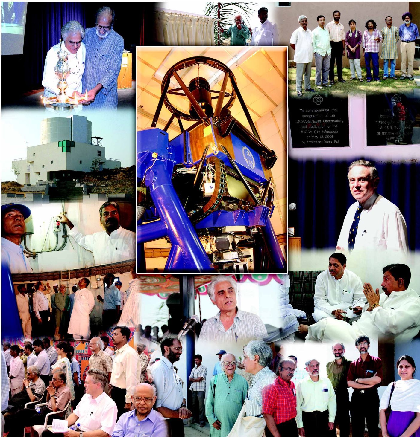
Highlights of the inauguration and dedication ceremony of the IUCAA Girawali Observatory