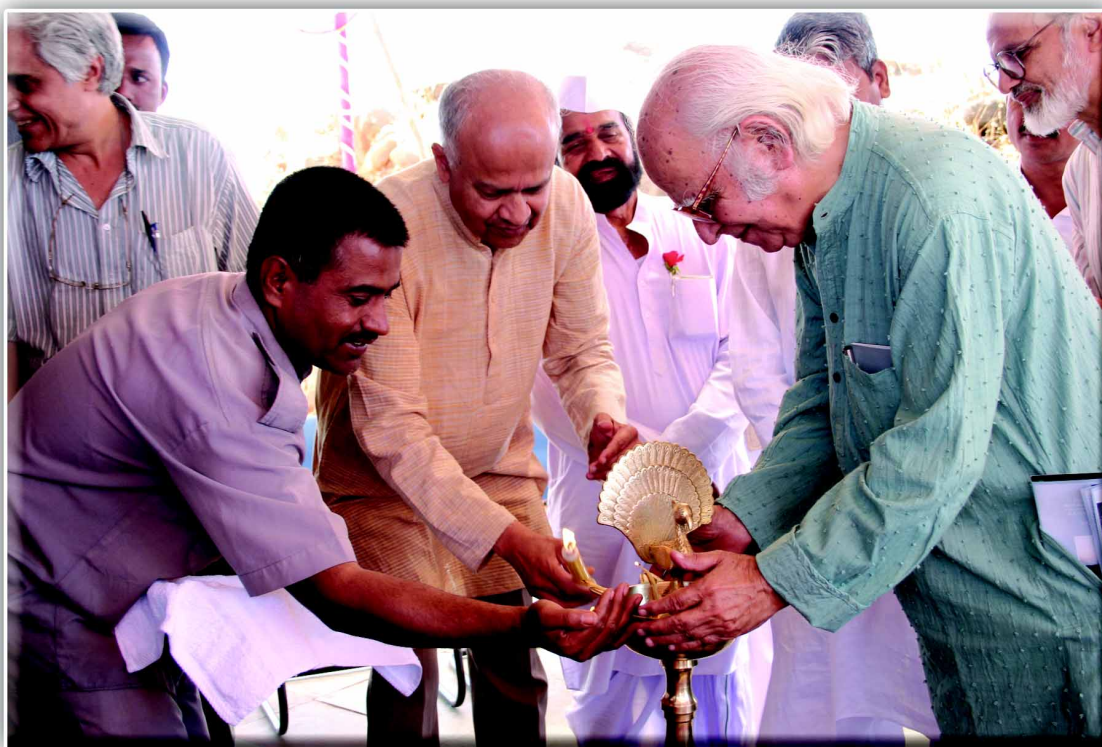
Professors Yash Pal and J. V. Narlikar lighting the lamp on the occasion of the inauguration of the IUCAA Girawali Observatory

Inauguration of IUCAA Girawali Observatory was on May 13-14, 2006. After a long and eager wait, installation and commissioning of the 2- metre telescope was completed in February this year. Soon after its commissioning, the telescope was put to use for photometric and spectroscopic observations; it delivered good images and on several occasions images sharper than 1" were obtained. The telescope was formally inaugurated and dedicated to the nation in a simple ceremony on May 13, 2006. In the morning, members of IUCAA, many astronomers from universities and other institutions, and people