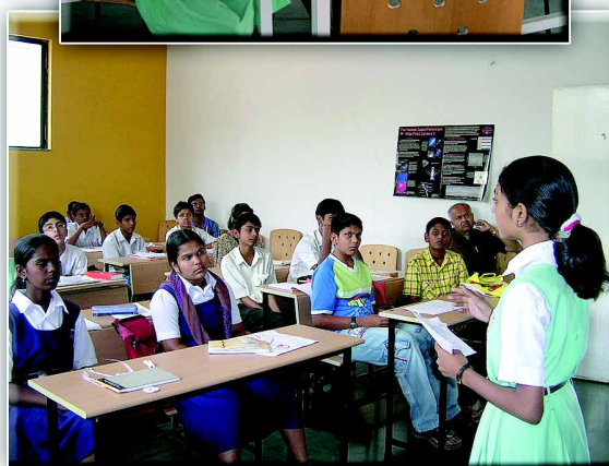
Participants of the School Students' Summer Programme in various activities